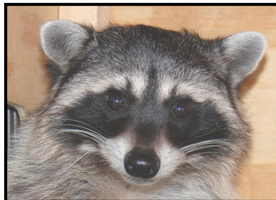
Ollie Project Wildlife Education Ambassador